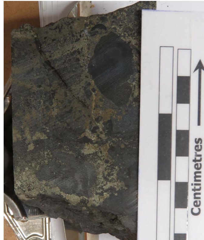
Brecciated argillaceous spiculite