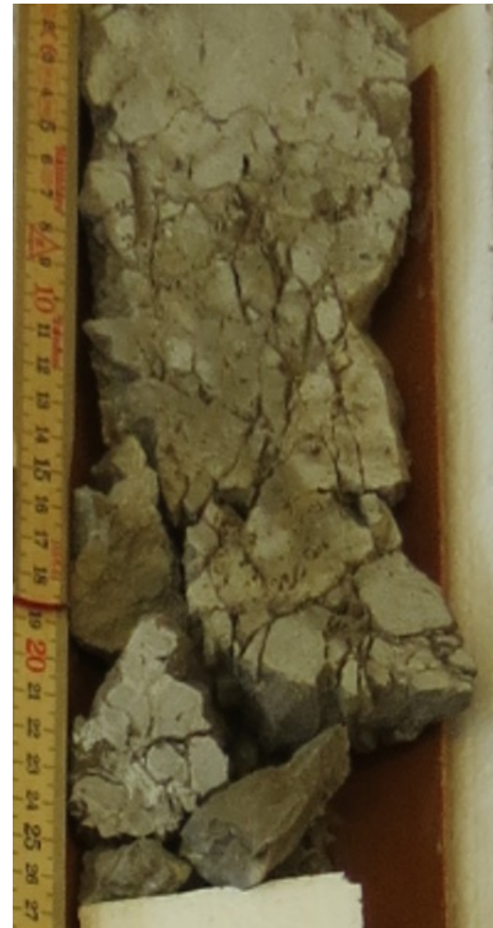
Crackle brecciated Ørn Fm