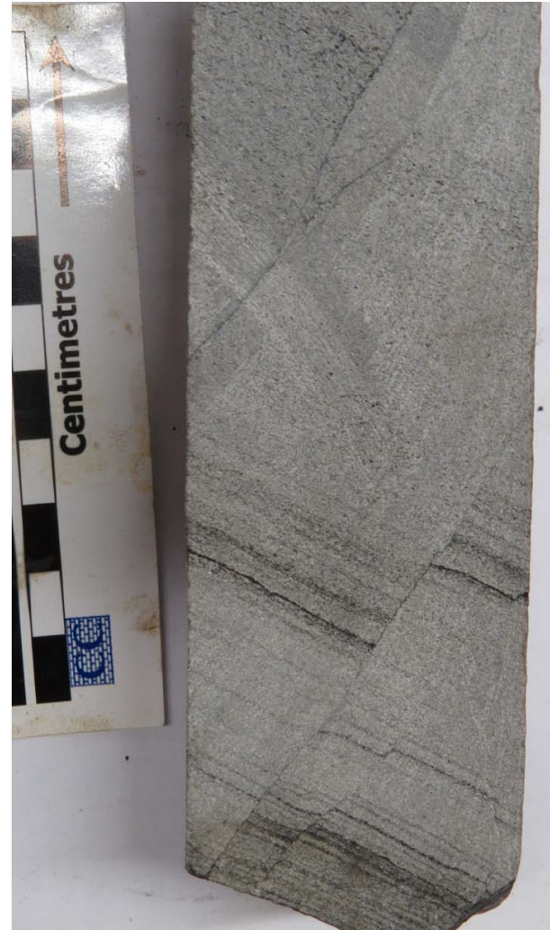
Soft sediment deformation