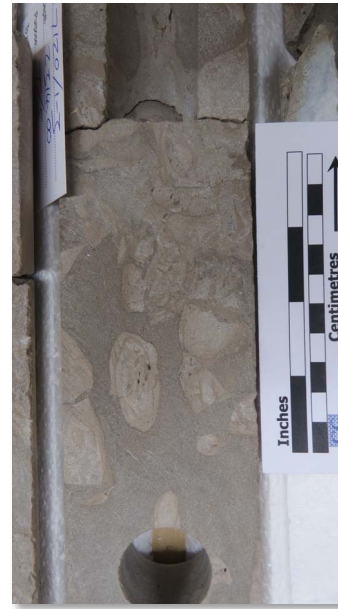
Stalactites in cave fill